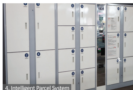
4. Intelligent Parcel System