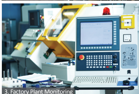
3. Factory Plant Monitoring