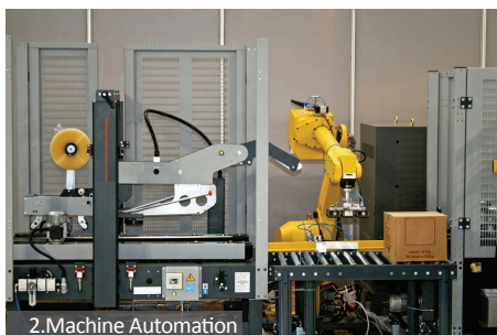
2. Machine Automation