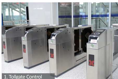
1. Tollgate Control