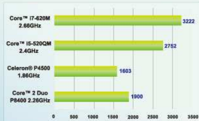
*The CPU benchmark is performed using Passmark® Performance Test 7.0 based on Win7 64bit OS.

Nuvo-1000 inherits remarkable features introduced to Intel Core™ i7/i5 platform, such as new 32nm micro-architecture, Turbo Boost and Hyper-Threading (2 cores/4 threads). The result is a significant performance improvement over previous Core™2 Duo platform. In addition, the new, integrated Intel® HD Graphics engine also doubles the graphics performance.