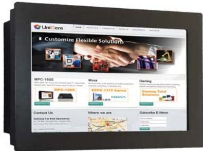
Optional Full HD

10.1" Panel PC, Intel® Braswell Celeron® N3160, IP65 Compliant Bezel & Wide Range Power Input