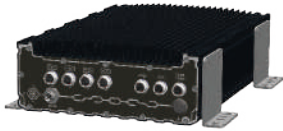
▲ SEMIL wall-mounted